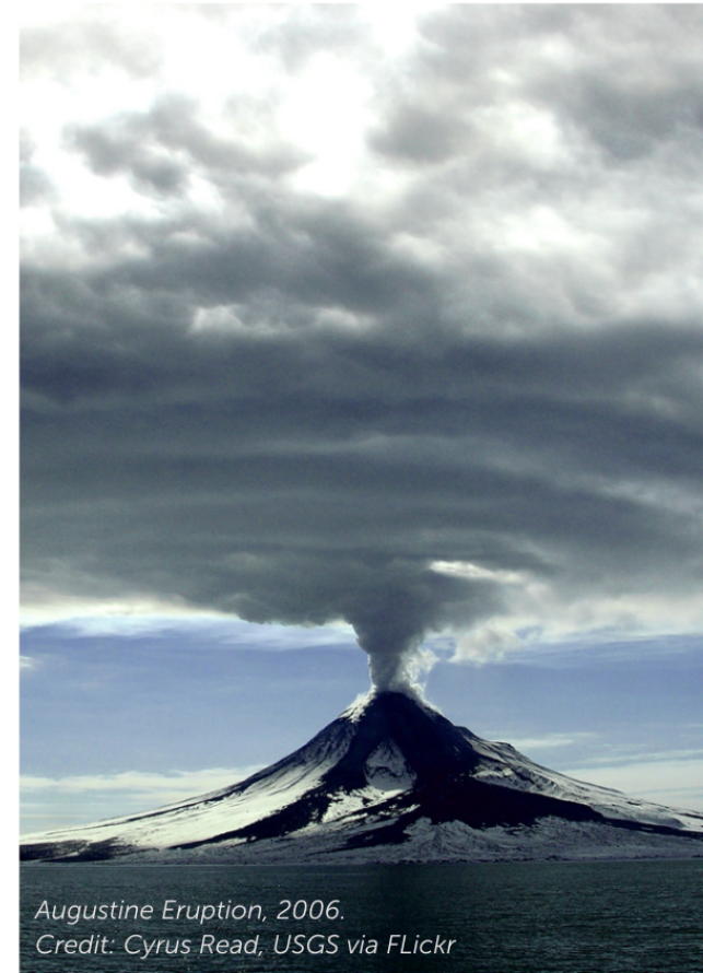
Augustine Eruption, 2006.