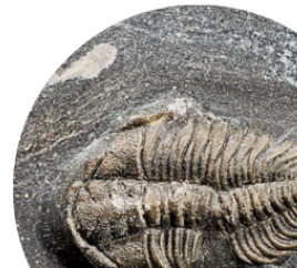
Ordovician trilobite Pliomerops escoti

Earth's second mass extinction took place in the midst of tetrapods occupying both sea and land, impacting about 75% of species. The cause of the extinction is still a subject of research, but the most likely cause seems to be ocean anoxia (a lack of oxygen in many parts of the ocean). Phytoplankton blooms due to large concentrations of nutrients associated with weathering caused by diversification of land plants led to bacterial decay, consuming much of the available oxygen and leaving "dead zones" in waters. Corals were severely impacted in this extinction and took millions of years to recover, a possible parallel to the effects of ocean acidification on corals in our oceans today.