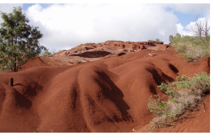
Chemically weathered rock (basalt) in Hawai'i.