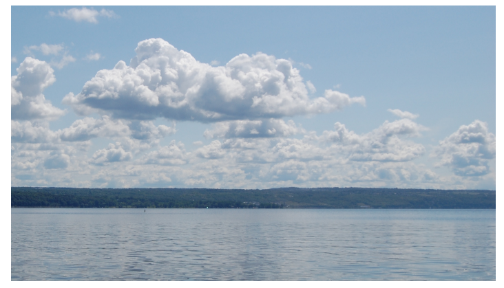
Cayuga Lake in Ithaca, NY.

Lakes, like Cayuga Lake shown below, also exchange CO<sub>2</sub> with the atmosphere, influenced by sources such as runoff and sediment washing into lakes. Both oceans and lakes emit methane, with studies revealing that lakes globally release more methane than oceans, despite covering less land area. A 2022 study* estimated that lakes worldwide emit approximately 42 million metric tons of methane annually.